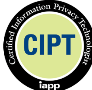
Certified Information Privacy Professional/Europe (CIPT)