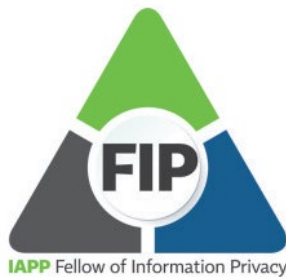
Fellow of Information Privacy (FIP)